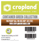
Custom Bar Code or RFID Labels

Developed with our customer in mind, the EPA Compliant tracking and labeling systems meet the latest Federal EPA and DOT ruling. Our tracking labels design meets and has approval by EPA 2011 PCC standards. They have visible serialized sequence numbering with code 125 double bar coding or 915 mhz RFID with visible numbering. We also carry all your DOT labels for the IBCs. These labels have a six year wear plan and have been tested and proven in industrial container washing applications. Combine these IBCs with the IBC Tracker system and you will comply with the first and only IBC Program to fully meet with all Federal DOT and EPA regulations.