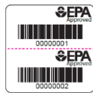
Generic Bar Code or RFID Labels